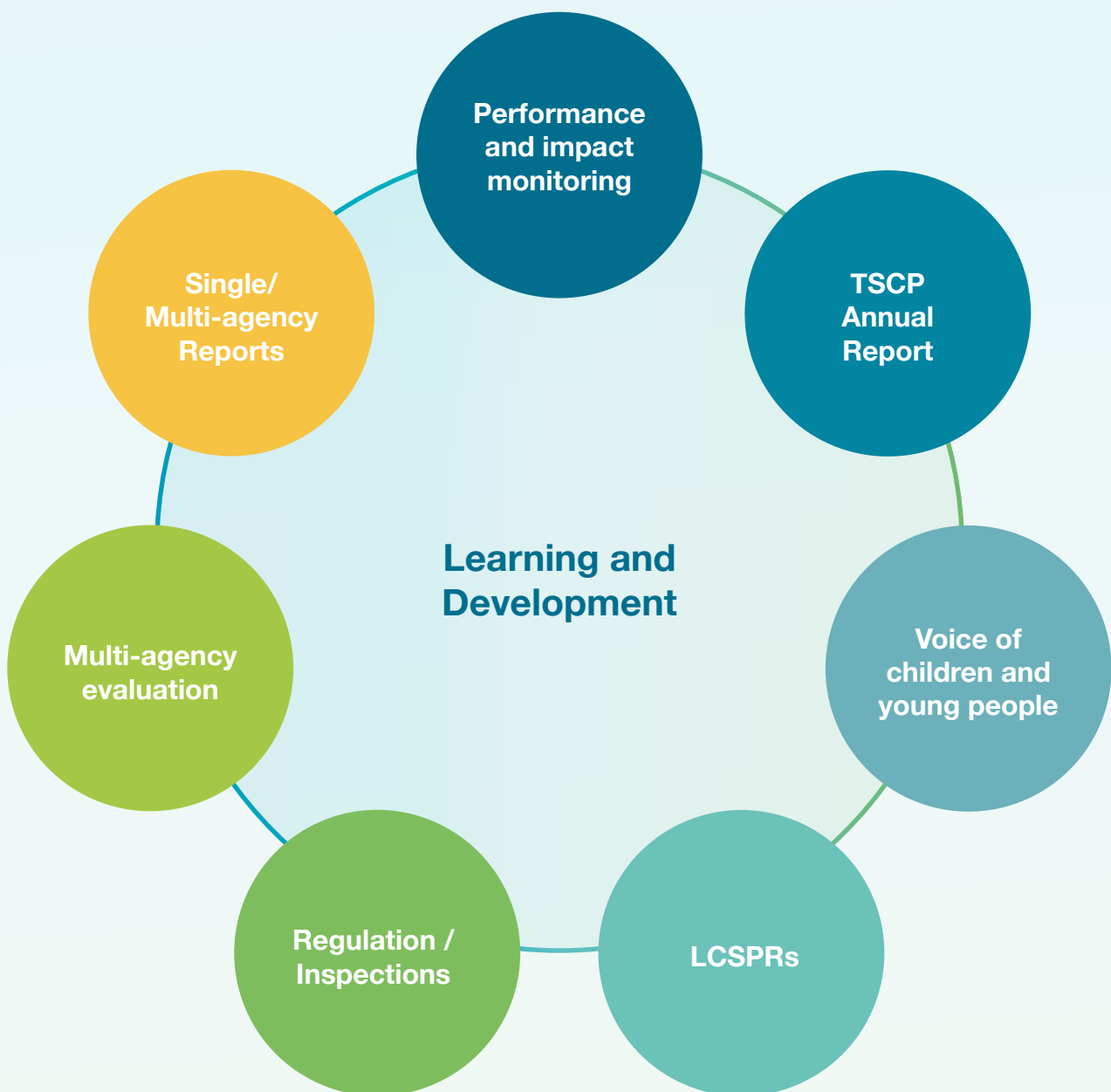
Figure 1 - Information sources to support identification of learning and development